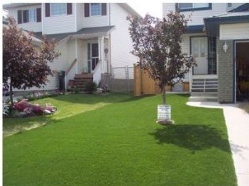
Incorrect – There should be a distinct boarder installed between the artificial turf and the neighboring natural sod.